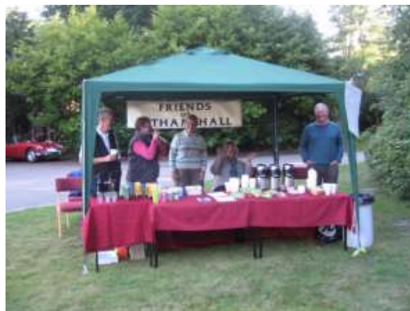
The Friends supporting the ‘Plays in the Park’

“They put in a huge amount of effort, entirely unpaid, and have made a very significant contribution to this pleasing total.” he said.