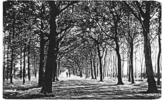
1900, a pleasant tree lined avenue