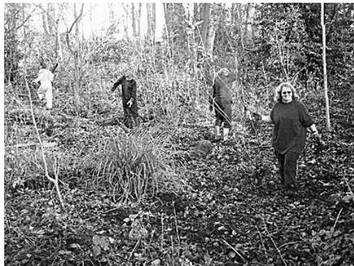
Clearing the pond

The first problems to be addressed were drainage, litter and dog fouling. A Management Plan recommended the removal of invasive weed species, such as young Sycamore and Himalayan Balsam, plus surveying and monitoring, and these tasks are ongoing. We are mindful of the importance of wildlife habitats, and as we learn more we hope to add to them.