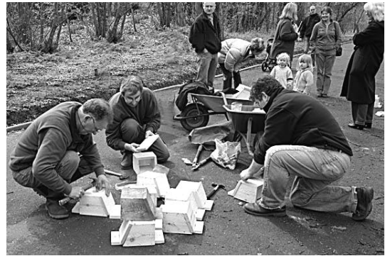
Installing bat boxes

Last year, to our great surprise, Green Drive was given an Environmental Award by North West in Bloom; the only such award in Lancashire.