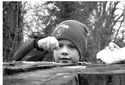
Winter bird feeding