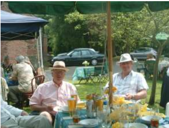
A good time at last year's Summer Lunch

This event was most enjoyable last year and is open to anyone who would like to come and join us. Entertainment will be supplied by the Jam Trio who performed so well last year.