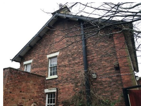
Side of the house showing older building Behind a Victorian frontage.