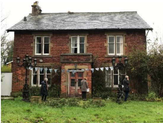
The farmhouse's Victorian Façade.

There are also worries about the drainage and possible adverse effects on the Hall Parkland. The Friends have written to Fylde Borough council supporting the views of the Civic Society and expressing concerns regarding the close proximity of any development to the Hall.