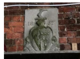
The walled Kitchen Garden showing the Clifton Coat of Arms and the gate piers.