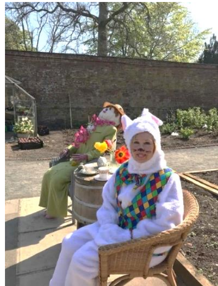
The Easter Bunny taking a well-earned rest with the scarecrow.

This event added £764.00 to the funds and the tea room did a roaring trade - it's thirsty work hunting Easter eggs!