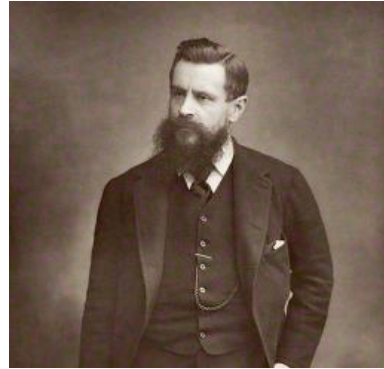
The 15th Duke of Norfolk, the Clifton Connection

12pm in the upper west wing. £2 to include tea or coffee.