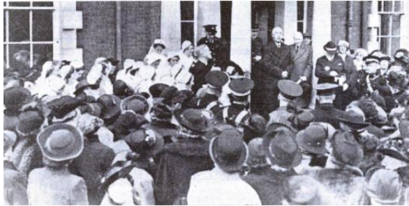
The opening of the convalescent home in 1940

In 1940 Lytham Hall's west wing was converted into a convalescent home for wounded members of the armed forces. Miss Alicia Cottrell wrote to tell us of one of the occasions she visited the Hall during the war. She was one of the members of a unit that called themselves "The Go To It Unit" which used to entertain members of the armed forces. One day they were entertaining at the Hall,