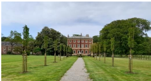
'Violet's Avenue' of Pleached Hornbeams.

There are lots of exciting things happening in the Parkland and some great projects are taking shape.