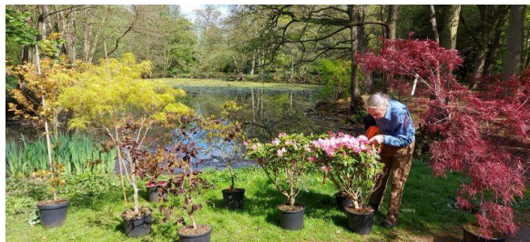
New Acers and Azaleas for the Japanese Garden.