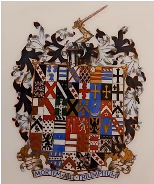
There is such a lot of history on this plate.

The key to the quarterings shows some familiar names: